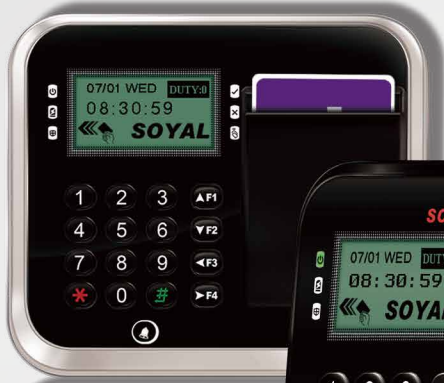
Energy Saver(RF Card) AR-837WD