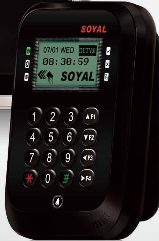
LCD Access Controller AR-837(E)