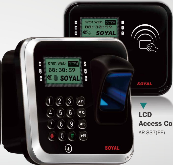
LCD Biometrics Access Controller