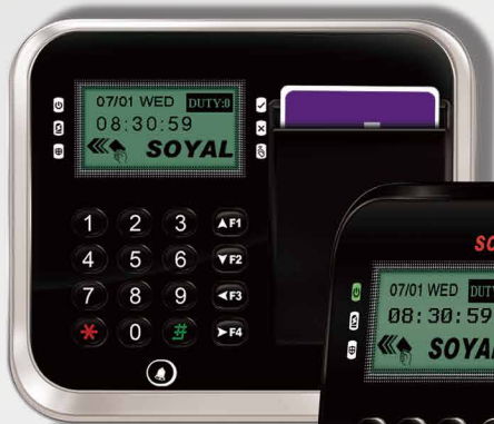
Energy Saver(RF Card)