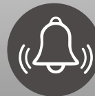
Door Bell button

AR-837(E)/AR-837(EF)/ AR-837(EFi)/AR-837(WD)